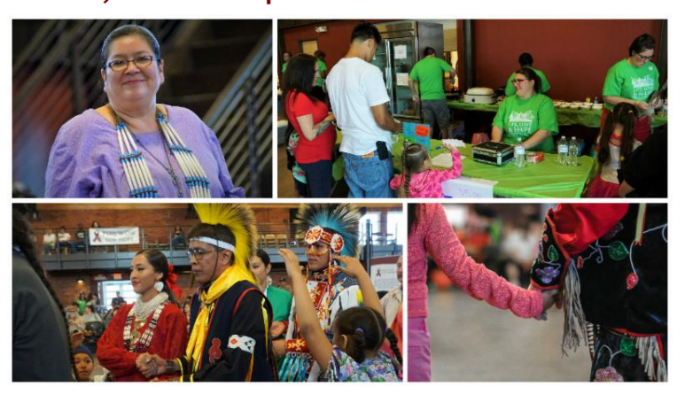
AICAF recently held our annual Powwow for Hope, marking five years of successful fundraising for our Native communities battling cancer.

AICAF's annual Powwow for Hope: Dancing for Life, Love & Hope was held May 7th at the Base Camp Facility in Minneapolis. The powwow opened with sunny skies and warm weather perfect for the outdoor events including creator's game, a mammography unit and rock climbing. With help from the community, we raised over $60,000 to help provide education on cancer prevention for American Indian communities across the United States and provide resources for those who are actively battling cancer.